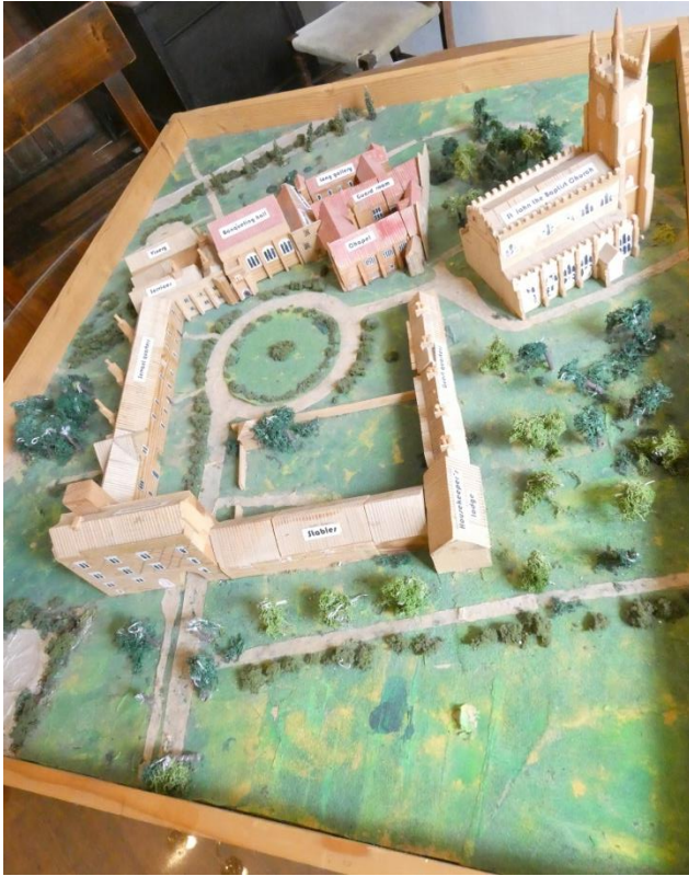
Model of Croydon Palace

three fish-ponds, running streams to the east and south, orchards and a 'fruit-house'. While the main buildings remain, the ranges of extensive stables, servants' quarters and gatehouse were subsumed into the growing town.