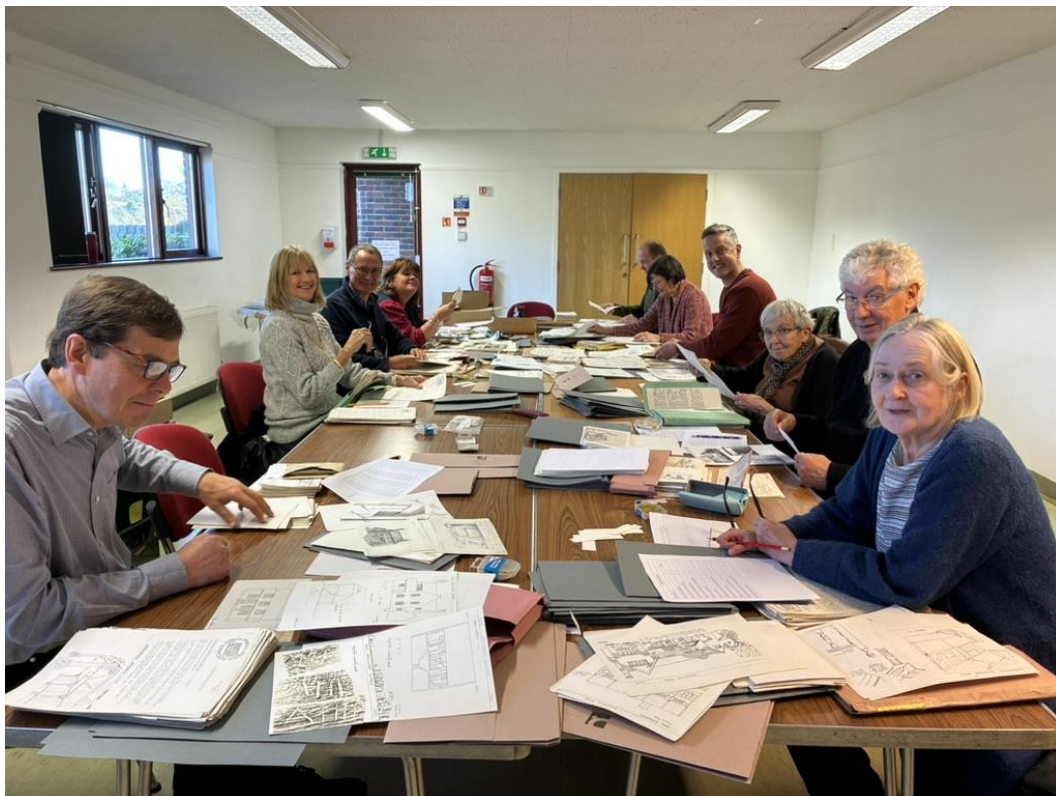
26 November – East Horsley Village Hall. A group of volunteers having fun with DBRG drawings.