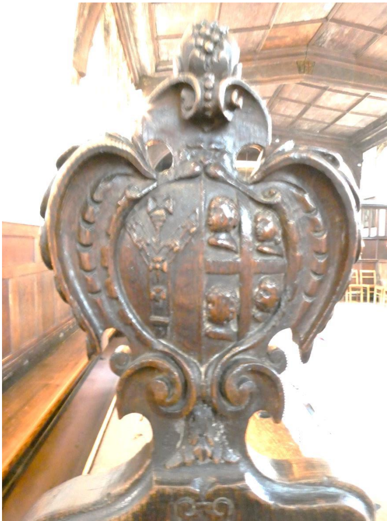
Croydon Palace Chapel Bench End (see p.10)