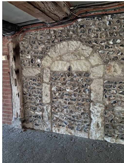
Early flint wall with blocked archway (Bernadette Sheehan)

Archbishops lived at Croydon Palace from perhaps before the C9 th to the late C18 th , though in latter years it had declined, eliciting regular complaints about its discomforts and 'unwholesome' atmosphere. In 1780 the archbishops sold the house and in 1807 bought the C18 th mansion of nearby Addington Place, which replaced a C16 th Tudor mansion. This became the Archbishops' official summer residence until 1897, and under their ownership was originally known as 'Addington Farm', only later adopting the title 'Palace'.