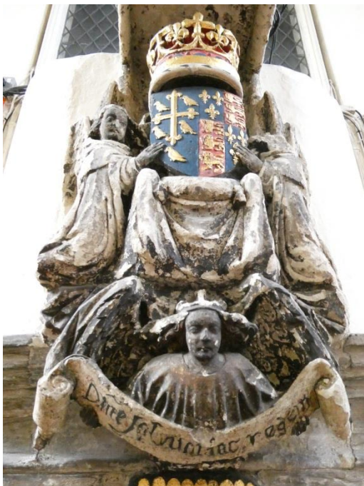
Arms of Henry VI

Under Archbishop John Stafford, the present Great Hall, or Banqueting Hall of c1450 was surmounted with an impressive arch-braced oak roof. This replaced an earlier hall of 1391, of which the original stone doorways were reused. There is no trace of a smoke louver, so perhaps the smoke dispersed through the eaves and tiles. However there has been some replacement of rafters. Later chestnut tie-beams bear the initials of Archbishop Thomas Herring and the date 1748. It